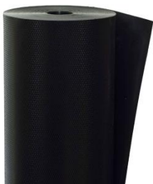
Root Barrier Product